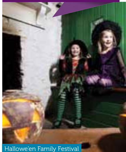
Hallowe'en Family Festival