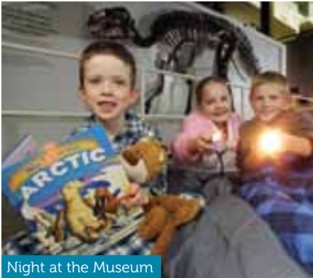
Night at the Museum

Are portraits spin, art or historic record? This course will consider the form and function of personal imagery from medieval heraldry to the 21st century. Places are limited so booking is essential. Tickets can be booked from Thursday 1st September by telephoning 028 9044 0017. The course cost is £50.00 an adult and £40.00 concession.