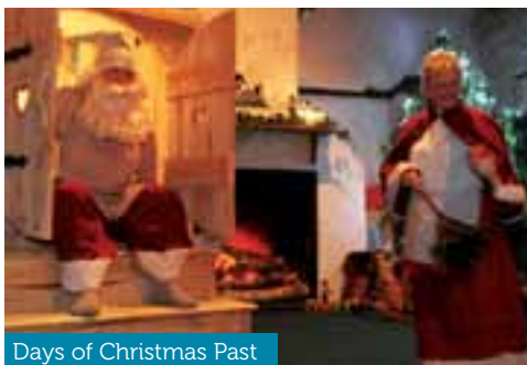
Days of Christmas Past

Why not join us to mark this most essentially American of festivals celebrating the determination of America's earliest settlers. Join the Partridges of Slippery Rock, Butler County, as they prepare the Thanksgiving turkey and anxiously await the return of their only son Joseph, an infantryman in the Union Army. Each re-enactment will last approximately 15 minutes and will commence at 1.00pm, 2.00pm and 3.00pm.