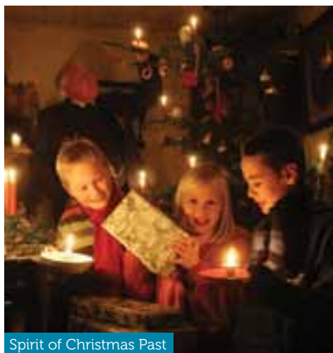
Spirit of Christmas Past