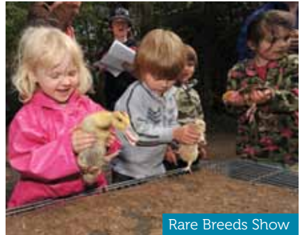
Rare Breeds Show

The Rare Breeds Survival Trust Sperrins and Lakelands Support Group stage a show of rare breeds of cattle, sheep, pigs and poultry. Exhibitors will be on hand to answer questions. Dexter cattle, Kerry Hill sheep, and Gloucestershire Old Spot pigs. Major event day pricing applies.