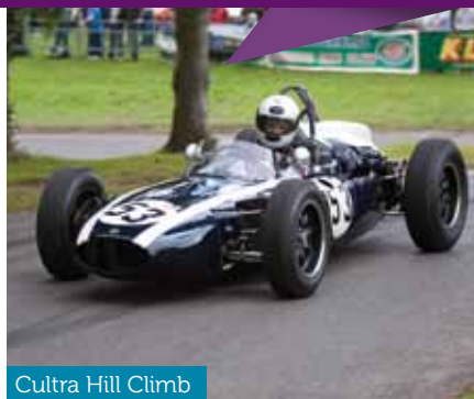
Cultra Hill Climb