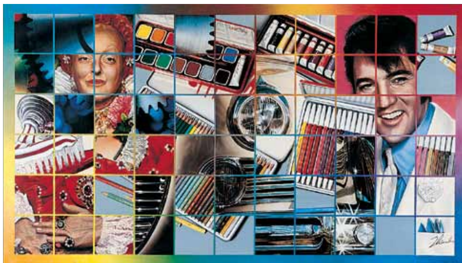
Mosaikbild 6 x 11 (1975) Peter Phillips b.1939

The 1960s is best-known as a decade of revolt and innovation and this exhibition will showcase some of the most exciting artistic developments of the era. The Ulster Museum holds one of the most important collections of 1960s art outside London and the display will also include works that influenced 60s artists and consider their impact on the next generation. Highlights of the exhibition will include works by Bridget Riley, John Hoyland, Gillian Ayres and Peter Phillips.