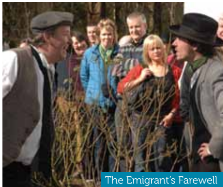
The Emigrant's Farewell

Thousands of people left Ireland in the 1700s and 1800s. For many, the hours before departure became known as the American Wake as the family gathered to bid a sad farewell to the departing emigrant. This dramatic re-enactment will take place at midday and 2.00pm.