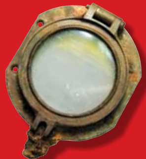
*3rd Class Porthole. Artefact on loan from RMS Titanic, Inc. © 2011

The costumed characters of The People's Story come to life with short plays and performances.