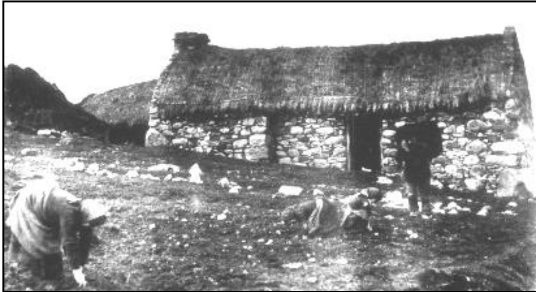
Byre dwallin c.1880. Gweedore, Coontie Donegal