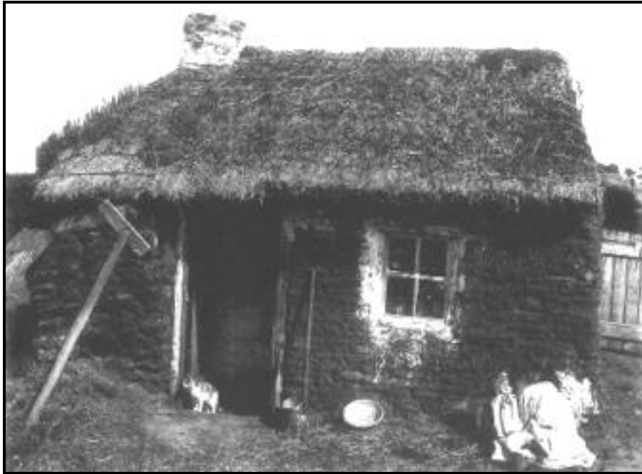
Divot Hoose nixt Toome Brig, Coontie Antrim